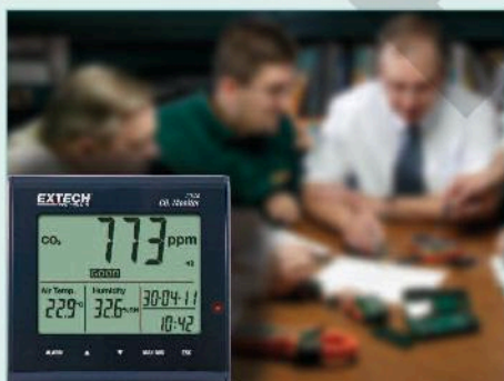
Desktop Carbon Dioxide (CO 2 ) Meter monitors the air quality in conference rooms insuring proper air ventilation